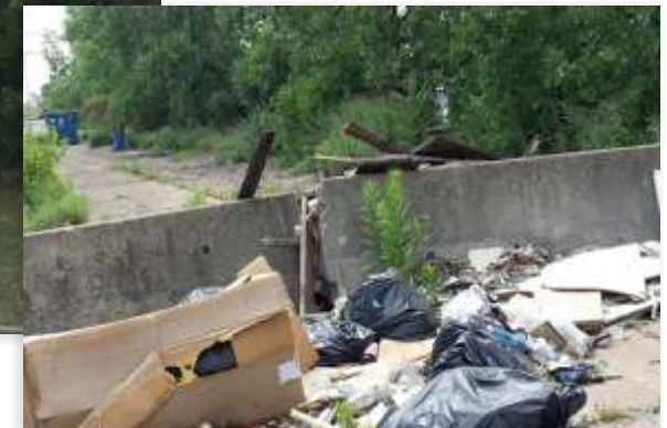
The dumping at West 3rd Street and Quigley Road is on the City of Cleveland's radar for cleanup and monitoring. The site was a point of discussion at CIRI Illegal Dumping and Metals Theft meetings first held in 2014.