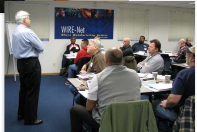
ERC Supervisory I Certificate Training at WIRE-Net