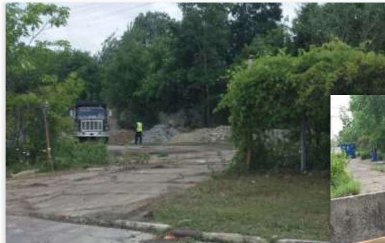
The dumping at West 3rd Street and Quigley Road is on the City of Cleveland's radar for cleanup and monitoring. The site was a point of discussion at CIRI Illegal Dumping and Metals Theft meetings first held in 2014.