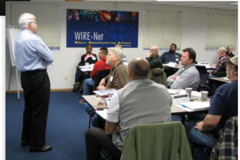
ERC Supervisory I Certificate Training at WIRE-Net